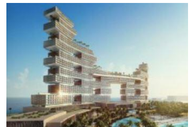
The final design.

In Dubai they are building yet another hotel – the New Royal Atlantis Hotel on the Palms. It will have six giant aquariums in the entrance with water falls and fountains. Not due to be opened until 2019 but work is underway. Here is the very first tank being installed, the frame work will hold the Acrylic box – but why up in the air? Because it will be over a dance floor and the dancers can look up to see fish swimming over their heads. More news as it develops (because one of my relatives is the engineer on the job!).