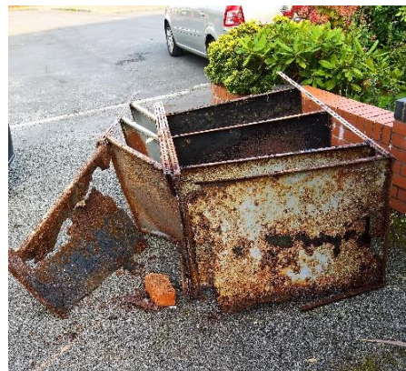
The original metal stands – past their best!