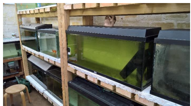
The new wooden stands arrive and are installed