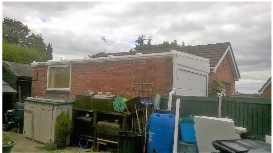
The new door and roof