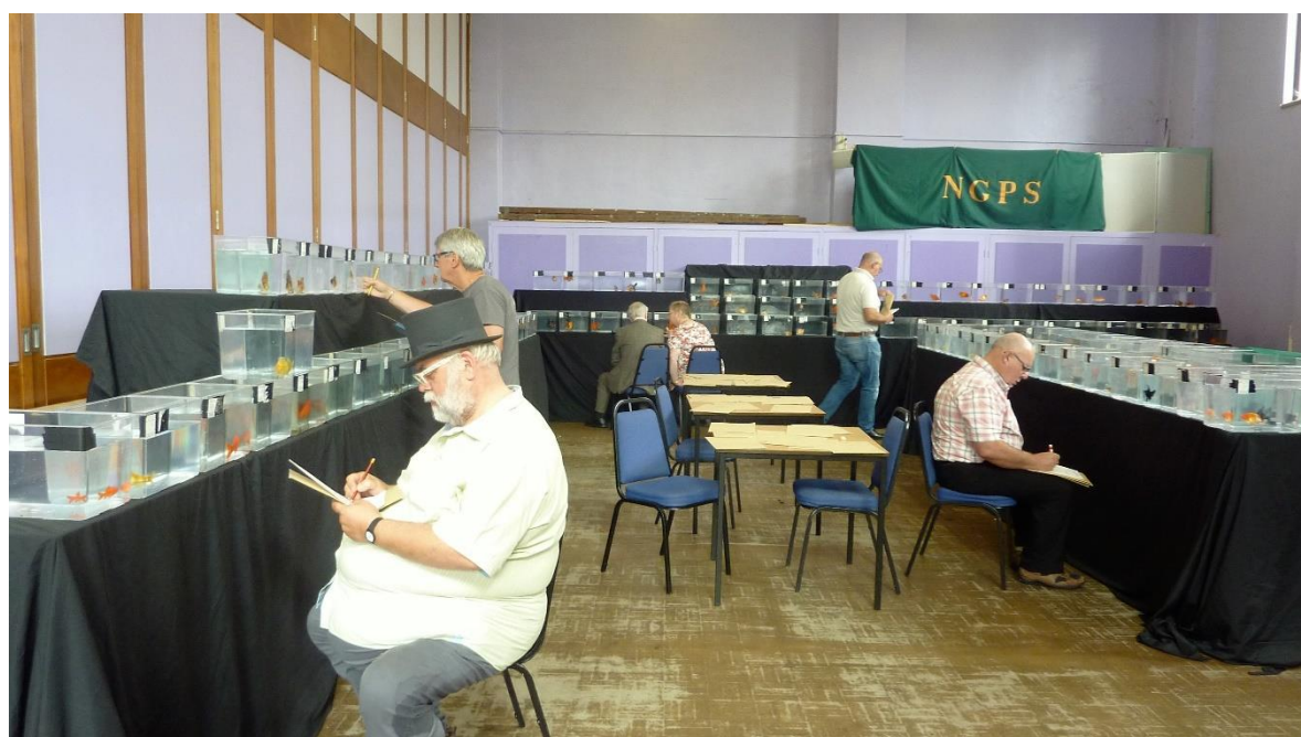
NGPS Open Show 2016 – Judges at work with the 126 entries