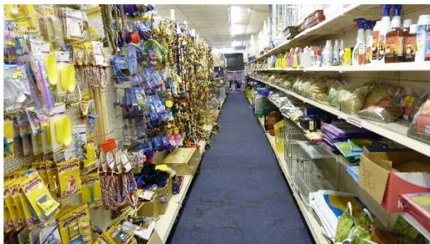
Rows of aquatic accessories