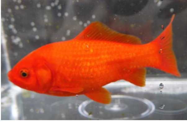
Dean's Common That is far from common.