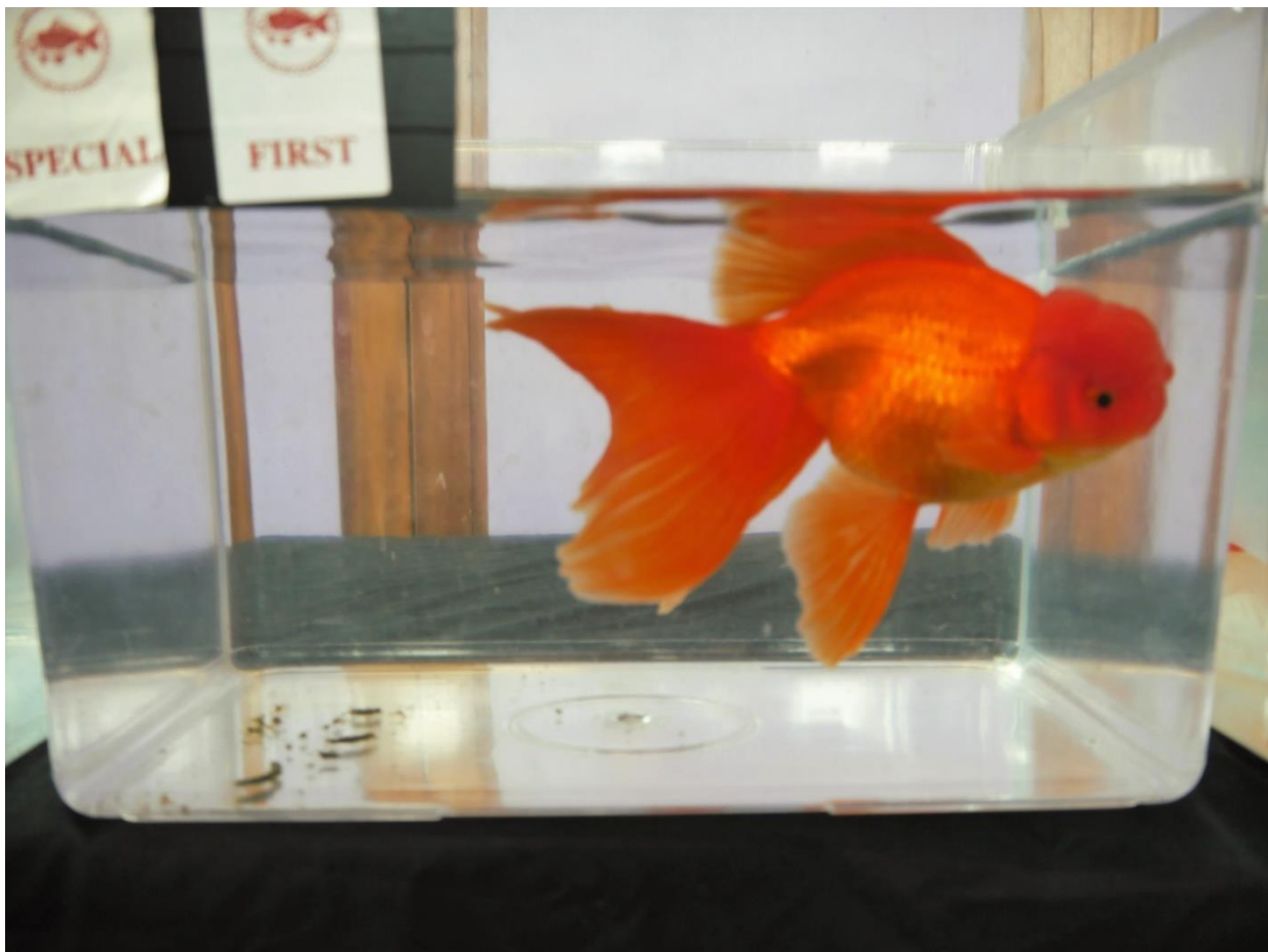
A Worthy Winner