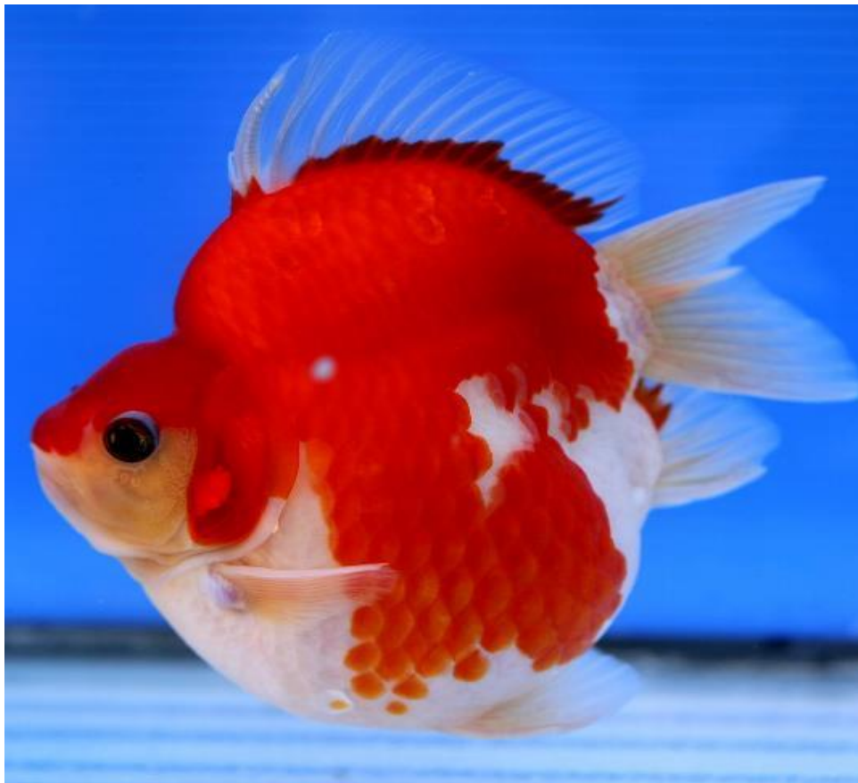
The Japanese Champion Tamasaba