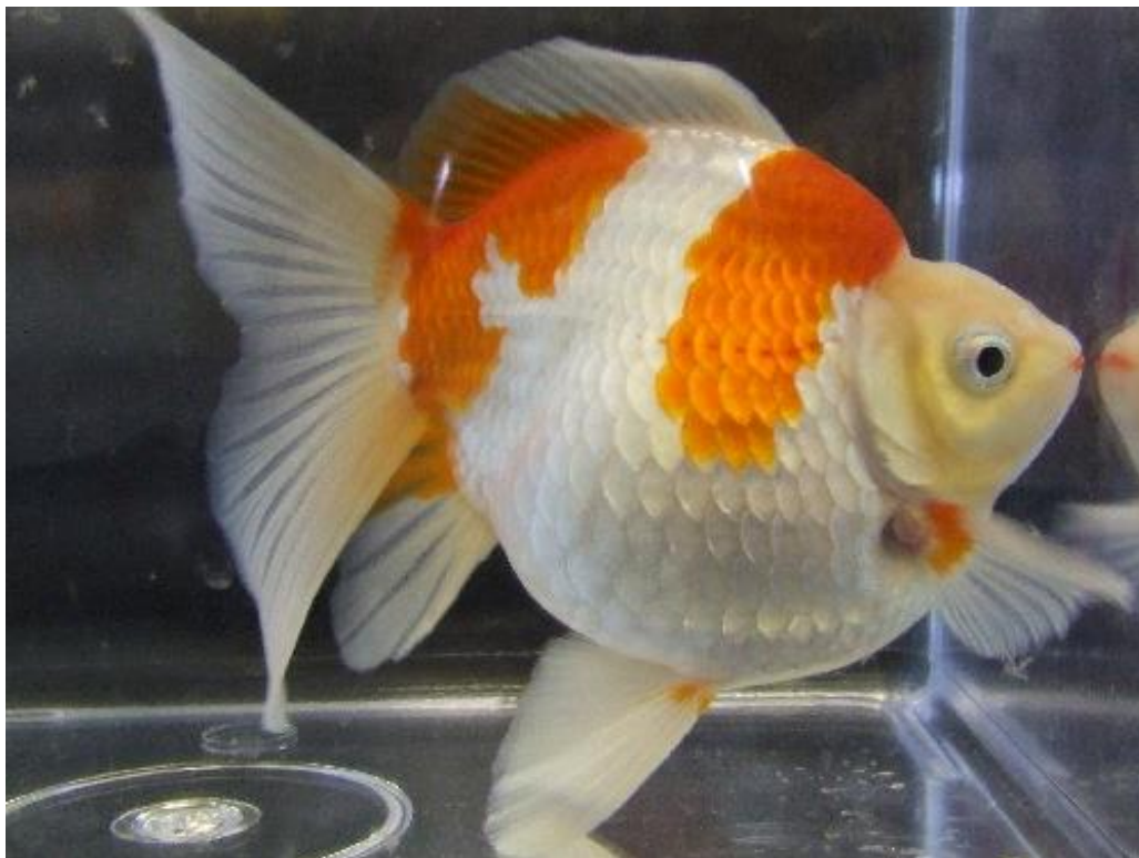
My Sabao that took 1 st place in the GSGB show 2010 AOV class

SABAO: Rounded body shape, the body line from head to shoulder is smooth (no Hump)